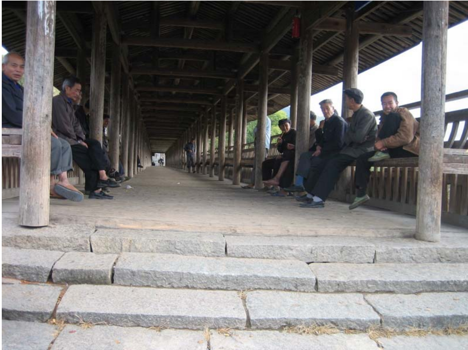
Enjoying the fresh area at one end of the Wan'an Bridge, Changqiao Township, Pingnan County, Fujian Province