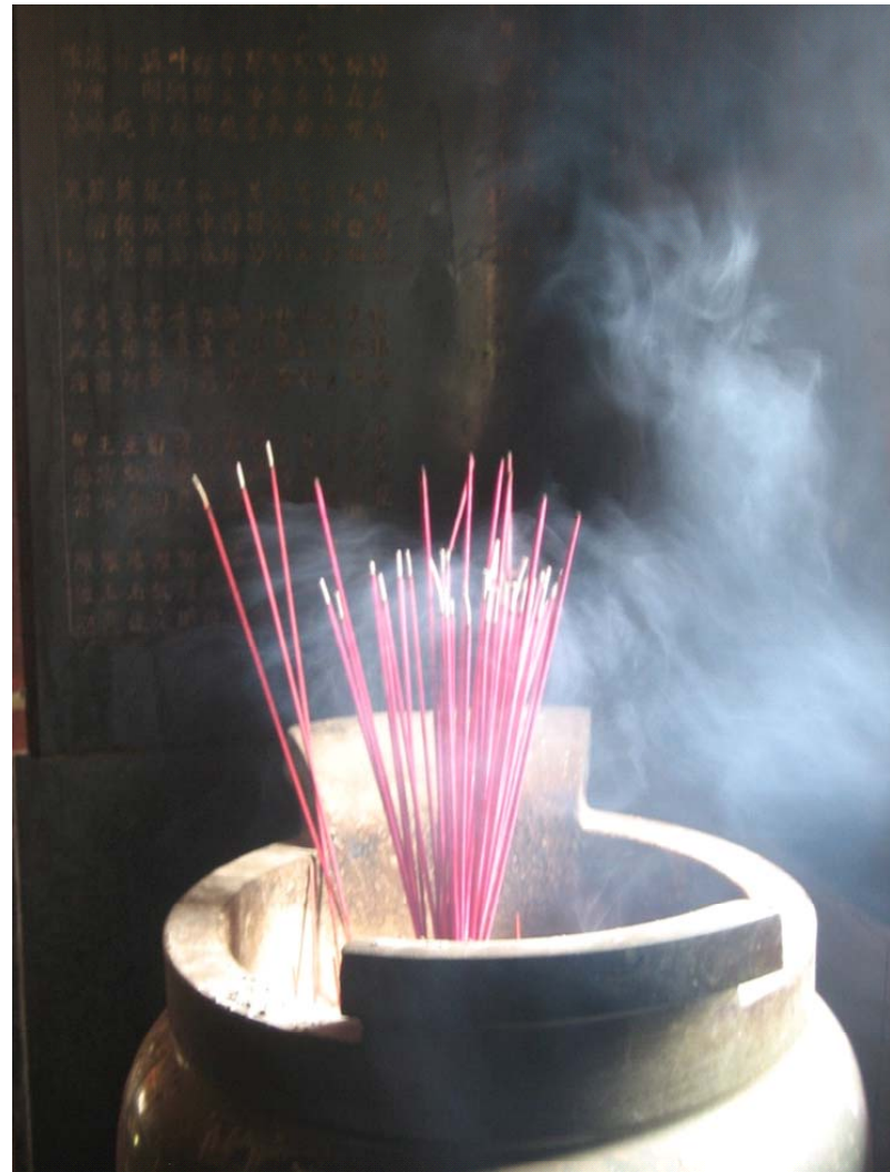
Incense burners, Dongguan Bridge, Dongmei Village, Dongguan Township, Fujian province