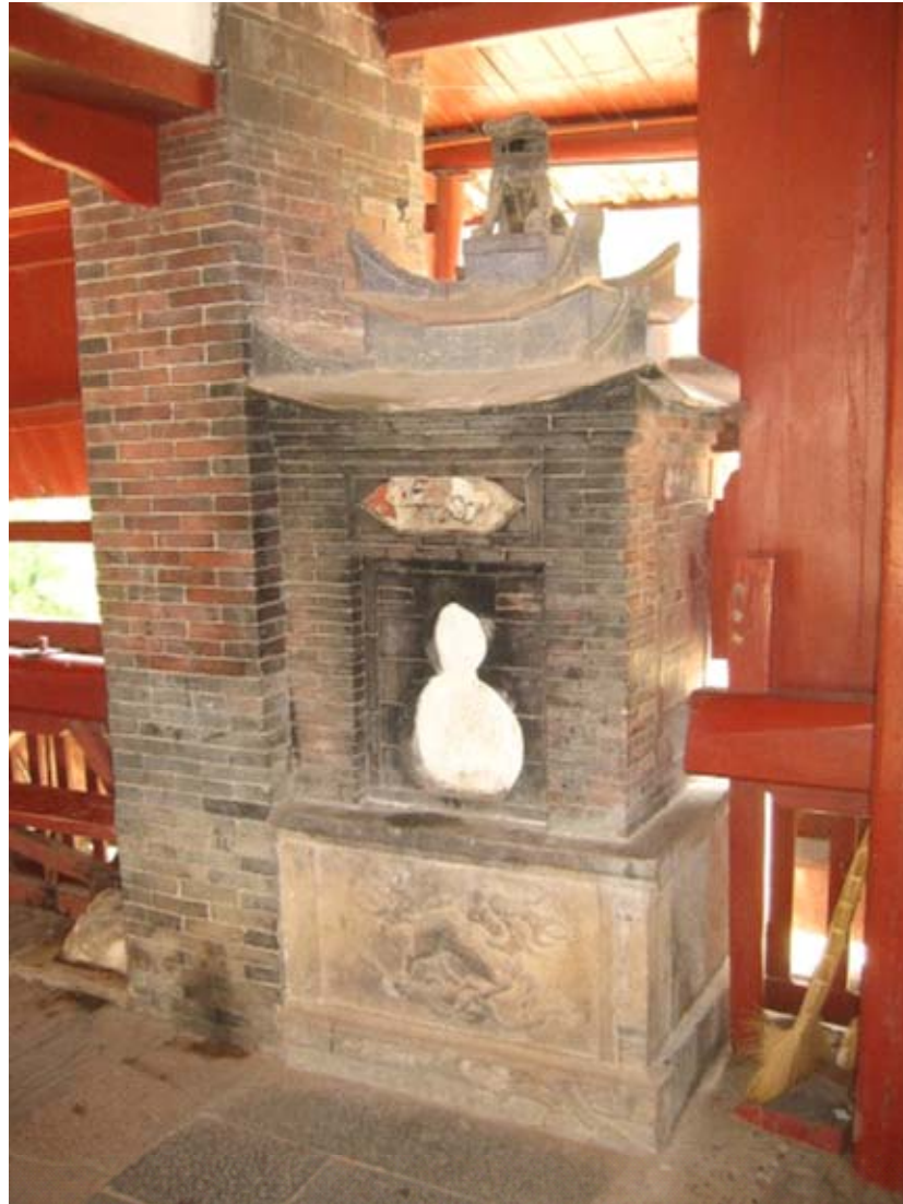
Main altar and furnace for burning 'spirit money' Dongguan Bridge, Dongmei Village, Dongguan Township, Fujian province