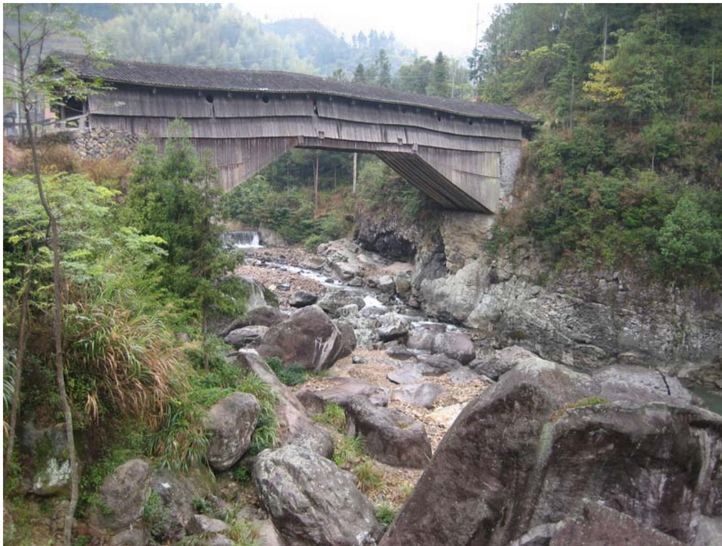
Yuanfeng Bridge, Xiadang Township, Shouning County, Fujian Province 47.6 meters long with an open span of 37.6 meters. 4.9 meters wide