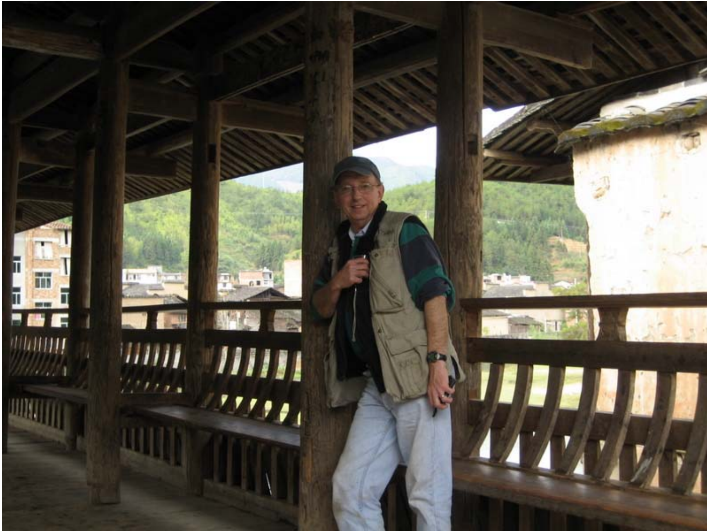
Wan'an Bridge, Changqiao Township, Pingnan County, Fujian Province November 2006