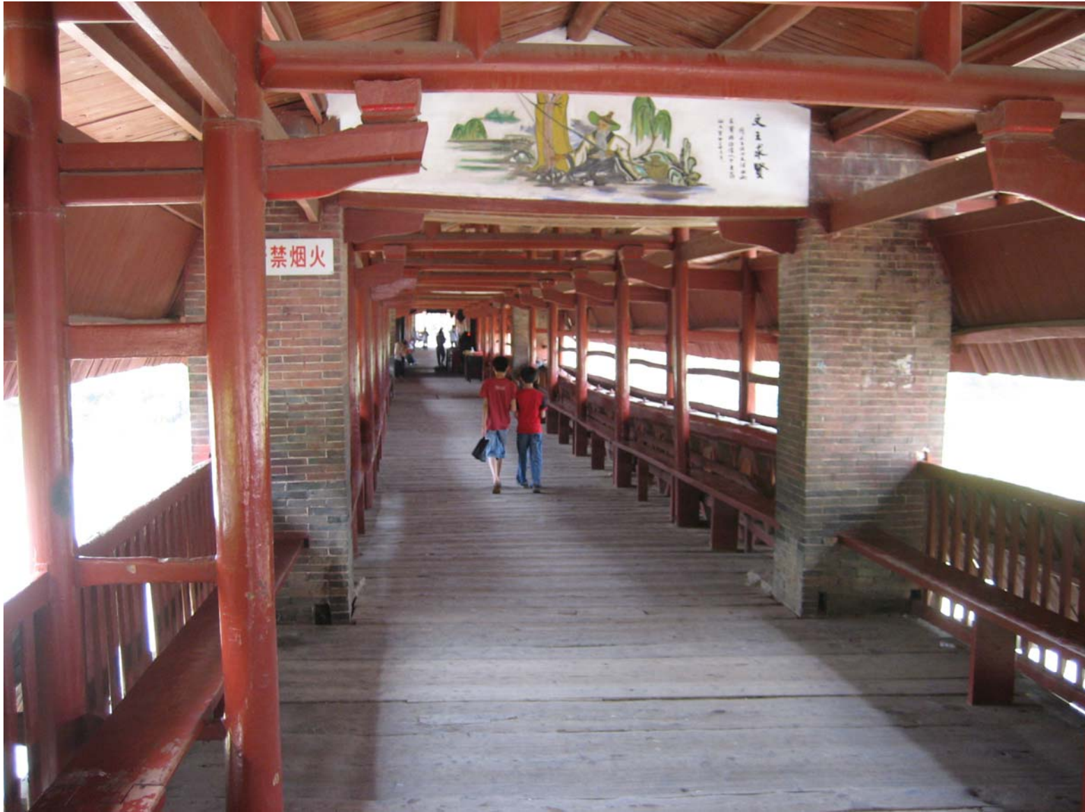
Painted corridor of the Dongguan Bridge, also called Xian [Immortals] Bridge, Dongmei Village, Dongguan Township, Fujian province