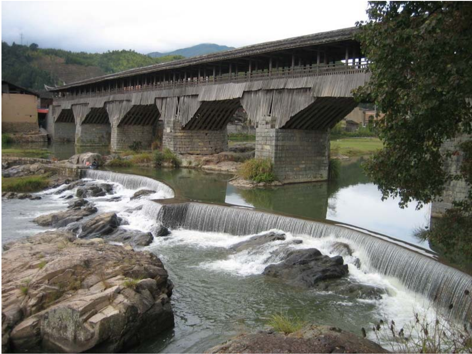
Wan'an Bridge, Changqiao Township, Pingnan County, Fujian Province