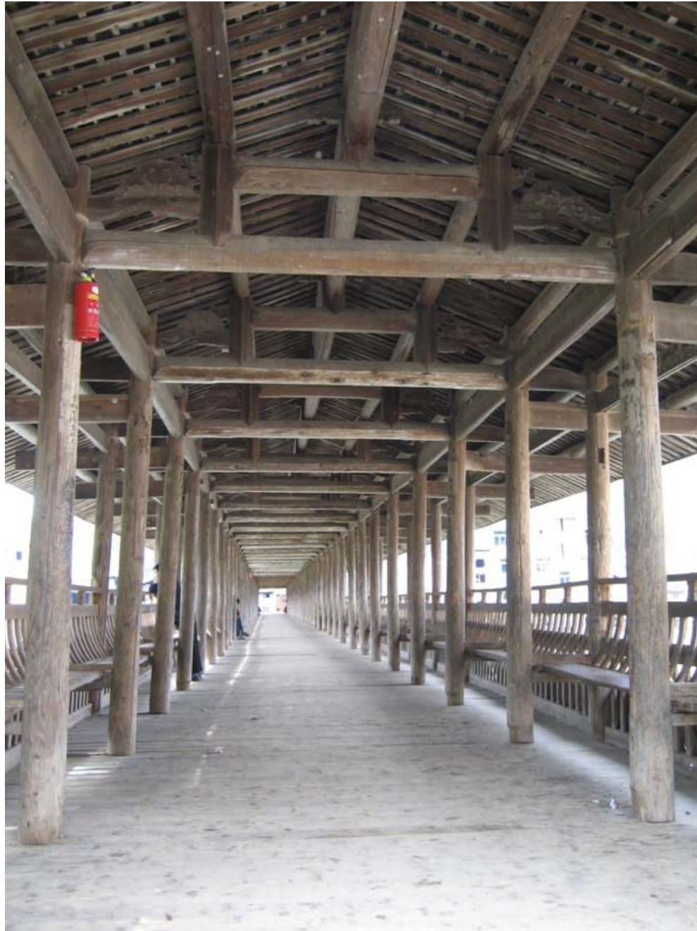
Covered Corridor of Wan'an Bridge, Changqiao Township, Pingnan County, Fujian Province