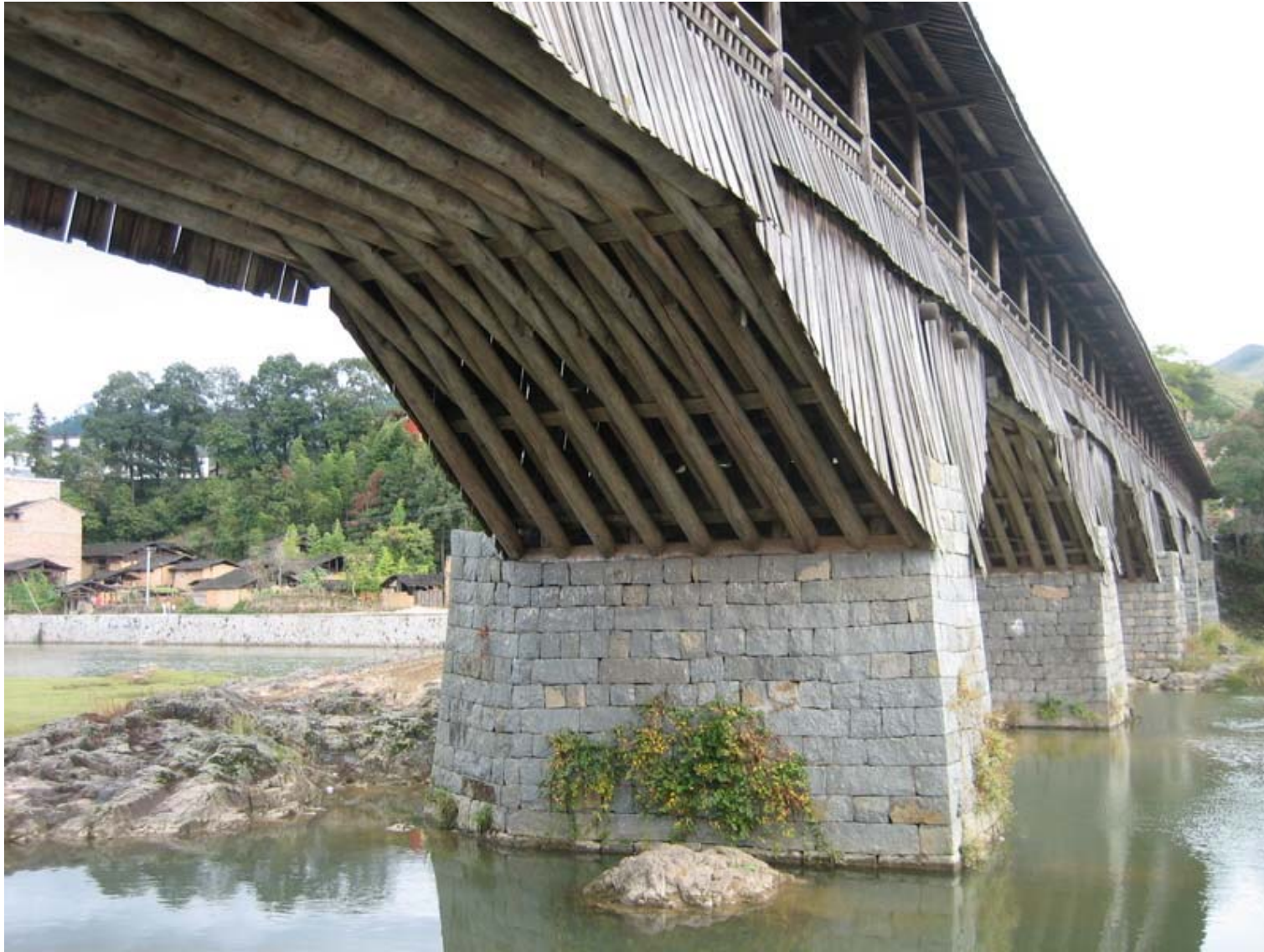
Wan'an Bridge, Changqiao Township, Pingnan County, Fujian Province

Longest woven timber framed bridge in China