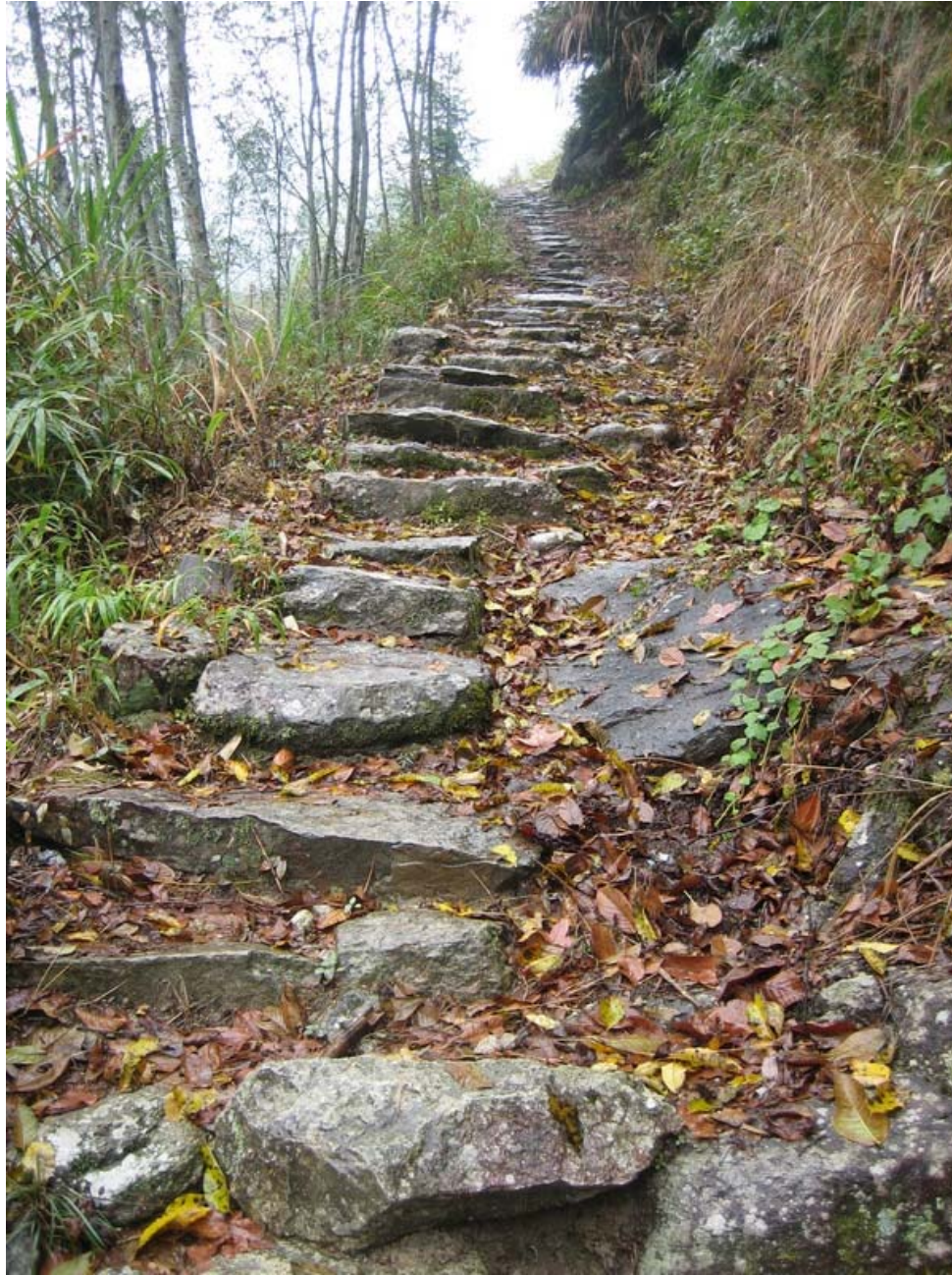
The stone path leading from the mountain to Yuanfeng Bridge, Xiadang Township, Shouning County, Fujian Province