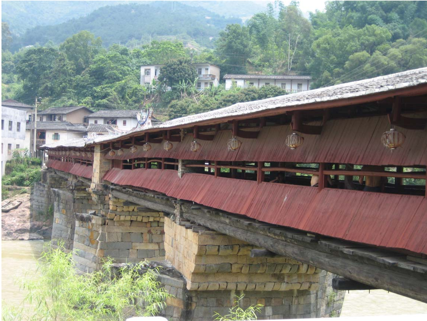
The Dongguan Bridge, also called Xian [Immortals] Bridge, has a complex set of shrines within. Spanning Huyang River, the covered bridge is located in Dongmei Village, Dongguan Township between Yongchun and Xianyou, Fujian province. Built in 1145 during the Southern Song period and renovated often in succeeding centuries, this cantilevered wooden beam bridge is 85 meters long and 5 meters wide and is set upon four 15 meter high piers. The central portion of the arcade contains an elaborate altar with a variety of censors.